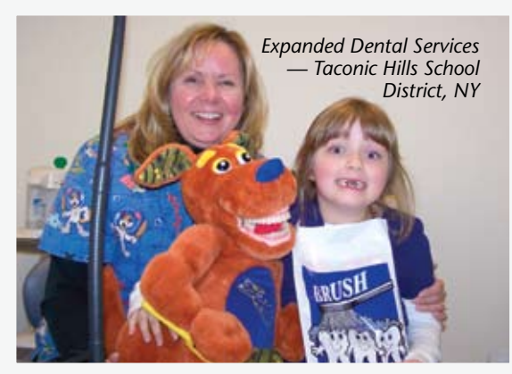
Expanded Dental Services - Taconic Hills School District, NY