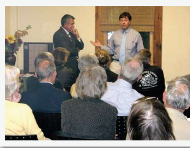
Healthcare Reform Presentation at FCH

Transportation – The Foundation has been exploring alternative solutions to transportation issues in our service area. A task force was formed with interested parties to identify and discuss options for developing collaborative and multi-municipal transportation services in northeast Dutchess County. Nelson/Nygaard Consulting Associates was commissioned by the Foundation to conduct a transportation feasibility study of eastern Dutchess. The findings and recommendations will be used to enhance existing transportation and for planning new services. We are working with the Dutchess County Department of Planning & Development, Transportation Council, and providing them with the study results to help design routes and schedules that will serve our area.