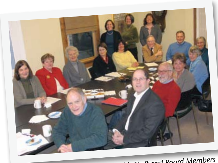
Foundation for Community Health Staff and Board Members