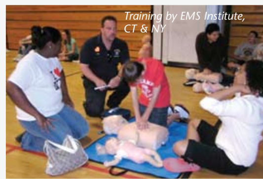
Training by EMS Institute, CT & NY

"If someone cyberbullies they should lose their internet for 3 months and have to say sorry to the person they bullied everyday!"