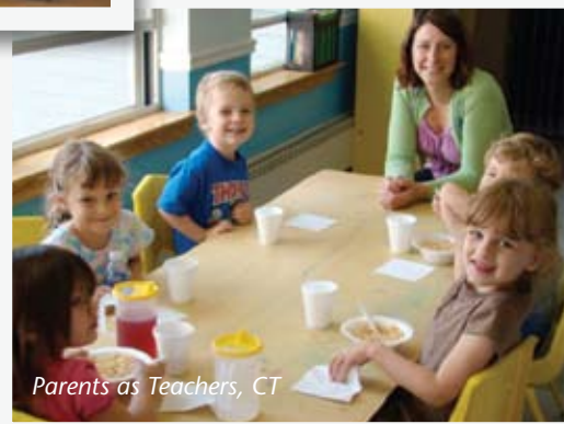
Parents as Teachers, CT

- 7th Grade Student, Salisbury Central School, CT Cyberbullying: Understanding & Addressing Online Cruelty