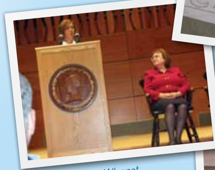
U.S. Health Care: Why not the Best? CT/NY