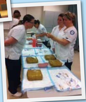
Nursing Program Implementation, CT