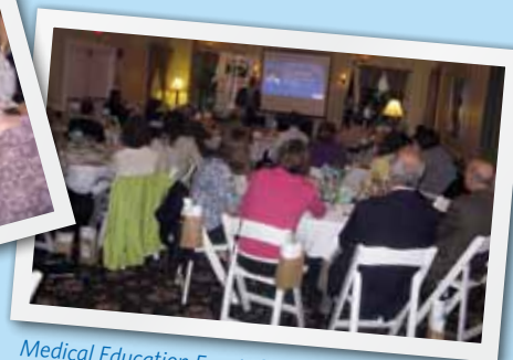
Medical Education Event, CT/NY