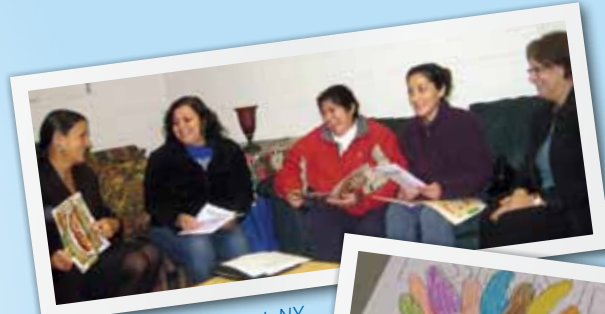
Kinship Circles of Support, NY