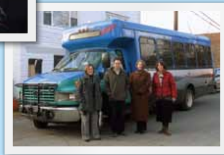
Northeast Dutchess Transit, Mobility Manager, NY