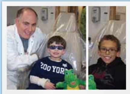
Expanded Dental Services-Taconic Hills School District, NY