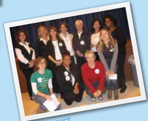
Food Day, NY/CT

2011 ANNUAL REPORT Working together to create healthier communities