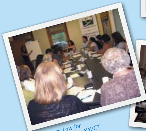
Immigrant Law for Providers Seminar, NY/CT