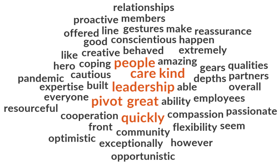
Figure 2: Word cloud depicting characteristics of organizations that enabled response to COVID

When asked what went well for organizations’ responses to COVID, respondents reflected on positive attributes and qualities that enabled their successes. Figure 2 presents a word cloud generated from the responses to the survey question that asked about strengths enabling organizational response. Many respondents noted their support from their organization’s leadership (middle and senior managers, executives, and boards), those deemed invaluable in facing the challenges of COVID.